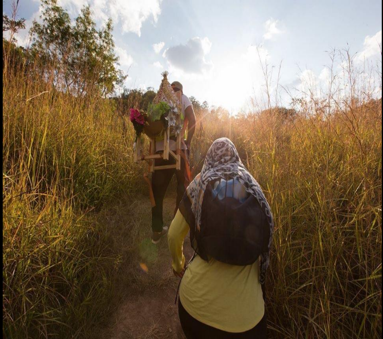
Simon carries the Cross.

In this time of isolation and suffering, what cross will you choose to carry for each other?