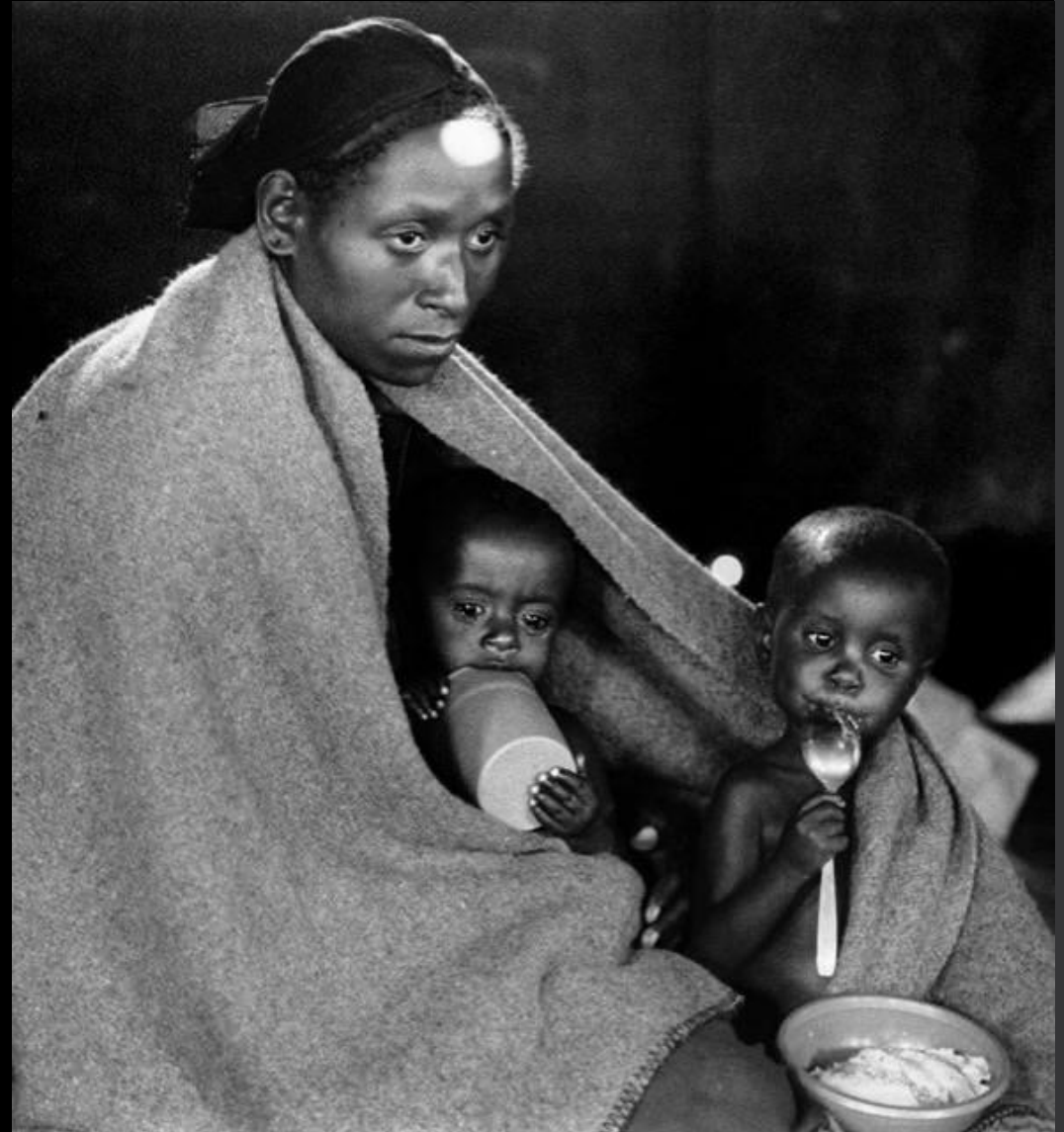
Mother and children: Guba, Ethiopia

In this time of isolation and distress, will you pray for the mothers of the world?